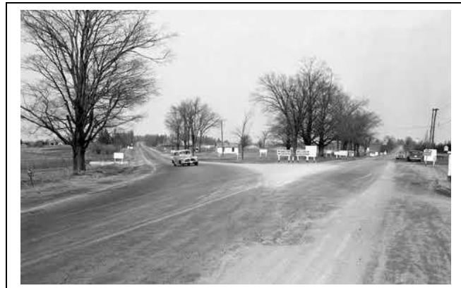
Duff's Corners 1952 Hwy's 2 and 53