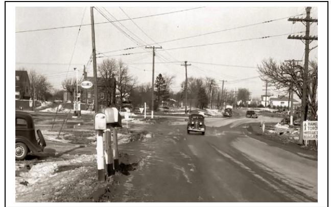
Rykmans Corners 1948