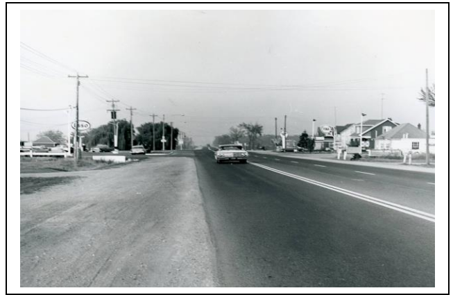
Elfrida 1964 Hwy's 53 and 56